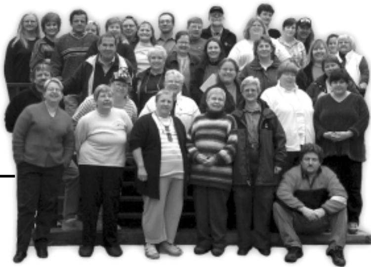
One of many great events in 2002, CHF Canada joined co-op members from Alberta at the joint-federations' Goldeye conference in October.

In 2002, 800 co-op members, staff and guests met together in Hamilton, Ontario. We streamlined the annual meeting to make it a better experience for delegates. We introduced a new program to help smaller co-ops attend. And we launched a member task force to consult with our members on our democratic functioning and the composition of our board of directors.