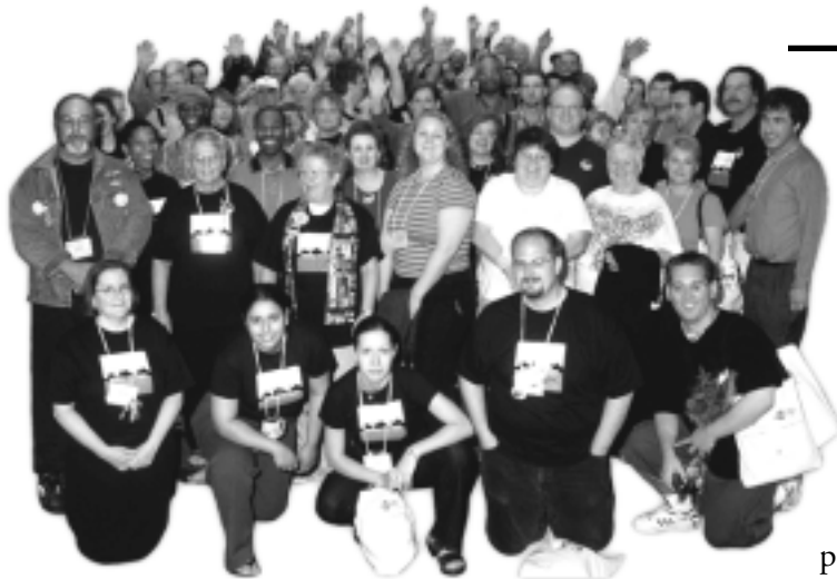
More than 800 co-op members from across Canada gathered together in Hamilton, Ontario for the 2002 AGM in June.

I n 2002, the Co-operative Housing Federation of Canada helped our nearly 800 member housing co-ops deliver quality housing to their members and bring the benefits of co-operative housing to more Canadians. Here are some of the highlights of the year.