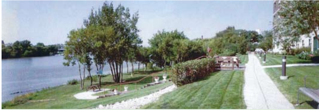
Columbus Centennial Housing Co-op when it was founded. Today, the river bank trees are gone and the stairs are rotten.