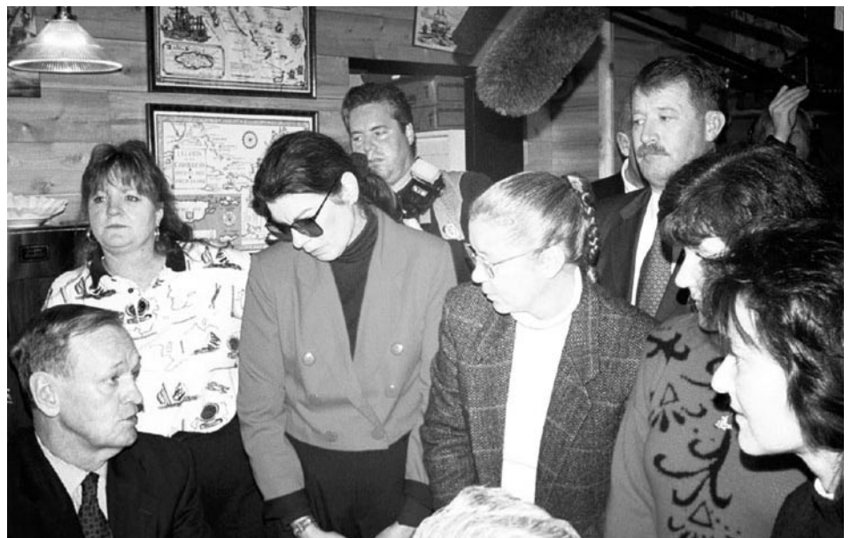
Members in Peterborough, Ontario, meet with Prime Minister Chrétien to discuss the future of co-op housing and promote the national agency.