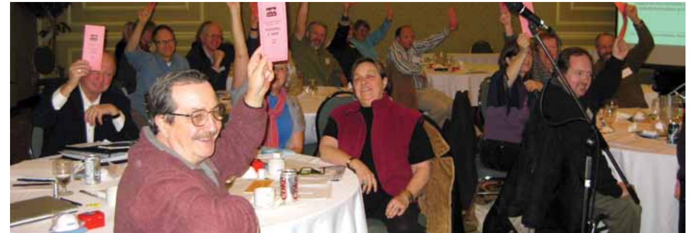
A co-op is a co-op because the members make decisions together, not because they do everything.

When we ask co-ops to explain why members should have to "participate" in their co-op, there are plenty of answers. But do those answers stand up under closer examination? Let's look at the six most common arguments.